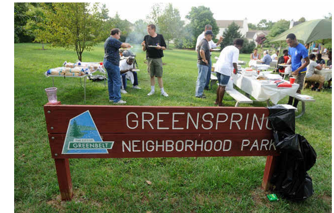
Greenspring, under construction from 1990-1997, and Greenbelt Lake Village, which opened in 1990, are the most recent housing developments to open in Greenbelt. Each summer, Greenspring I residence gather for a multicultural picnic.