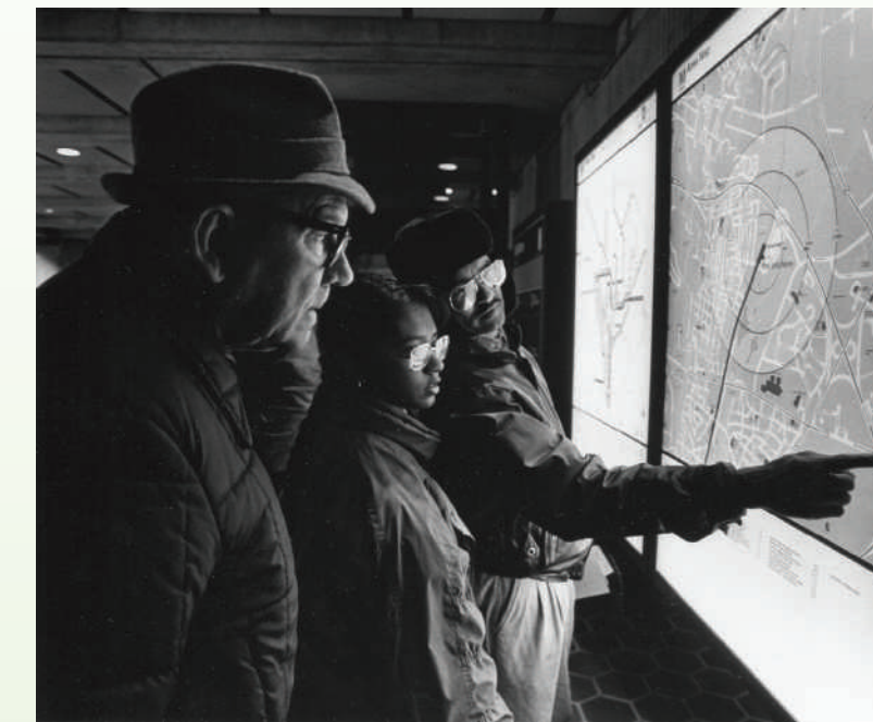
Greenbelt Station, the final stop on the Green Line of the Washington Metro Area Transit Authority's Metro system opens. Greenbelt News Review