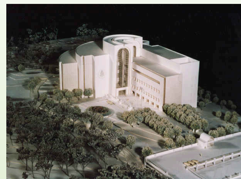
Construction begins near Indian Creek on a federal courthouse, officially called the U.S. District Court for the District of Maryland.