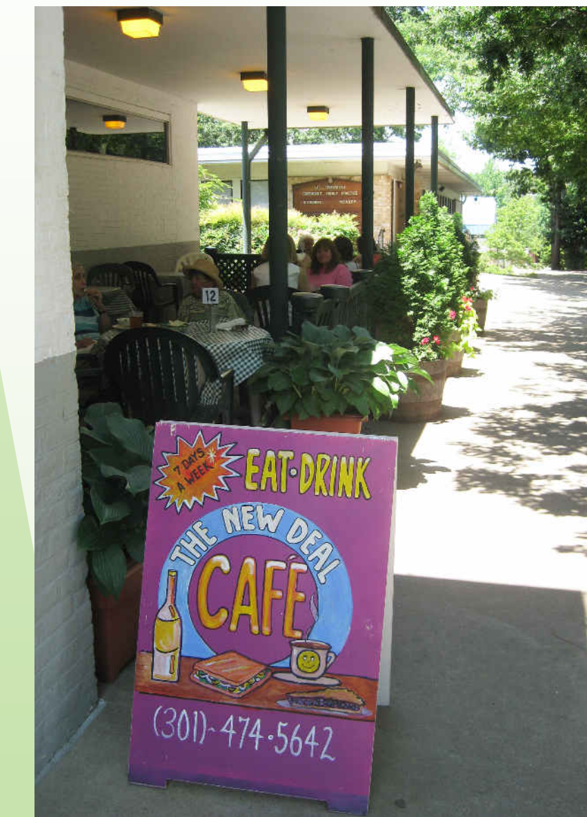
The New Deal Café, a cooperative initially operated by volunteer staff, opens for limited hours in the Community Center. It moves to Roosevelt Center in 2000 and as of 2010, when this photo was taken, continues to thrive.