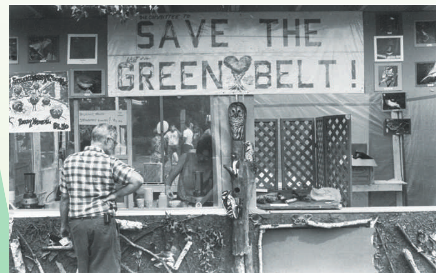
Committee to Save Our Greenbelt volunteers staff a booth at the 1991 Labor Day Festival. This citizen group works to preserve the remaining green space that once encircled the city.