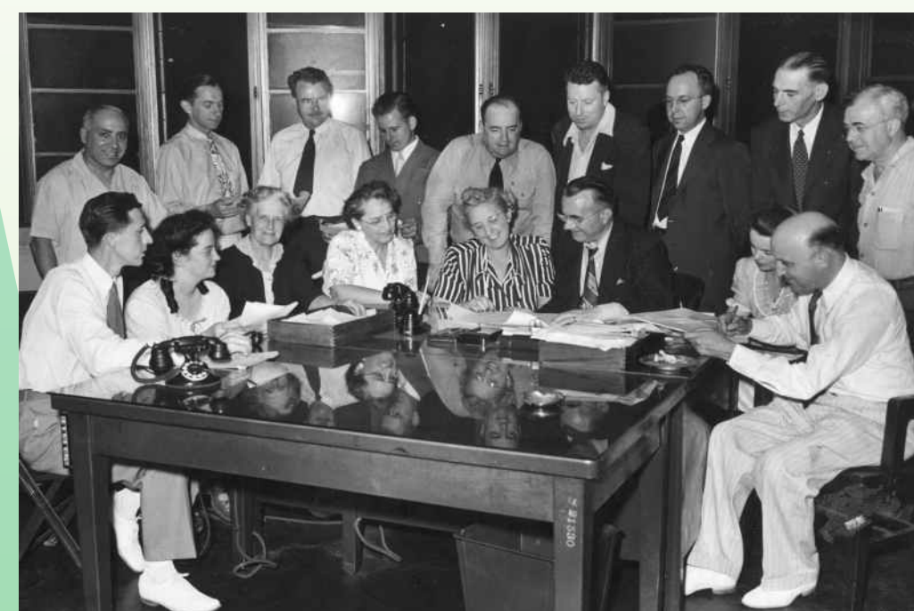
The federal government sells 1,572 housing units and 708 acres of land for $6,995,669 to the Greenbelt Veterans Housing Corporation, which would later become Greenbelt Homes, Incorporated, the cooperative that thrives today. Greenbelt Museum