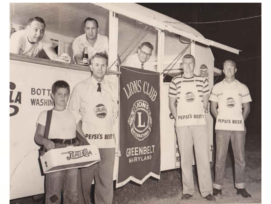
The Greenbelt Lions Club is first organized in 1952. The organization raised funds to support its charity endeavors by selling refreshments, organizing New Year's Dances, and publishing the bi-yearly Greenbelt Directory.