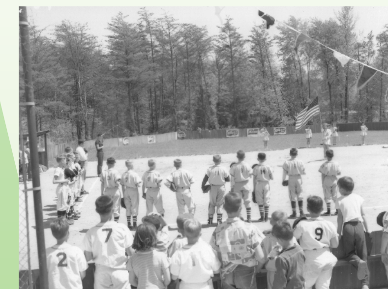
American Legion Post 136 opening day. Baseball, popular in Greenbelt from the beginning, continues to be a favorite pastime.