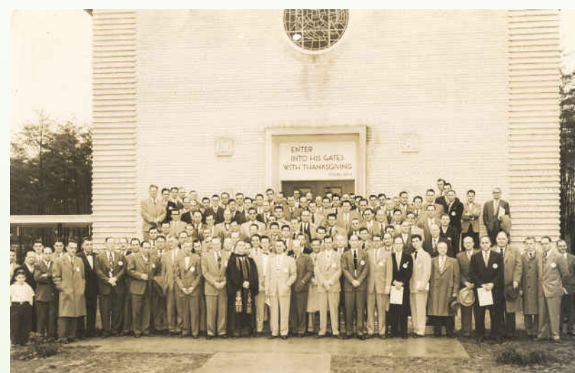
The Greenbelt Community Church opens. The federal government did not build churches in Greenbelt, but it did leave areas of land where residents could build churches and throughout the 1950s they did. Greenbelt News Review