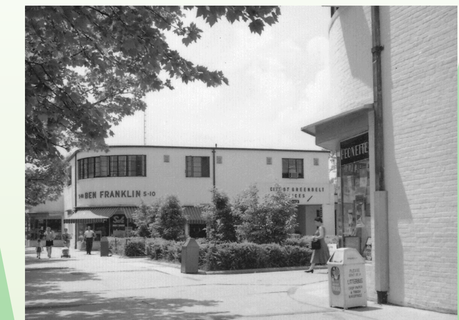
A Ben Franklin five and dime store opened in the center of town. It remained open for 30 years.