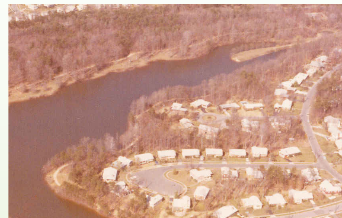
The first of 65 free-standing homes are built in the Lakeside development. This aerial photograph from 1974 shows Maplewood Court. Additional single family homes would be built in several areas in Greenbelt in the 1950s. City of Greenbelt