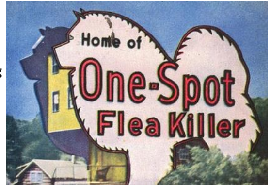
The former One Spot Flea Killer building and sign along Route 1 was one of many landmarks discussed at the talk.

landmarks such as diners, five & dime stores, movie theaters, drive-ins, and roadside structures such as the One-Spot Flea Killer building and neon sign (see image to the right, a detail of a postcard advertising the product.) The book, published by Arcadia and part of the Images of America Series, retails for $20 and will be for sale in the Museum gift shop.